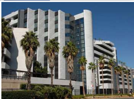
Investec Bank: Sandton Supply and fit Access Flooring