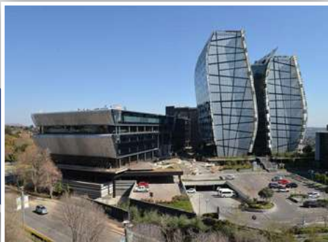
Barclays Absa Capital Supply and Fit Kingspan Access Flooring