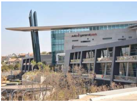
Auto & General Park: Steyn City Supply & install Access Flooring