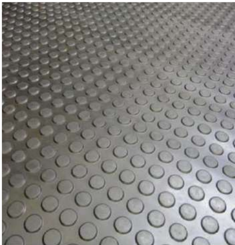
Studded Rubber Tiles