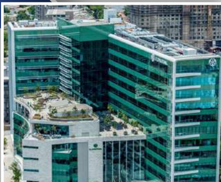
Old Mutual Sandton Supply & Install Access Flooring