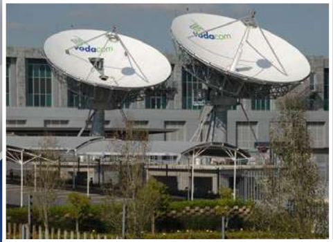
Vodacom : Midrand Supply & Install Access Flooring