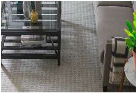
Domestic & Commercial Carpeting

We also Supply and installs a Full Range of Carpeting both Commercial and Domestic, Carpet Tiles, Carpet Planks, Stretch carpeting, Vinyl Sheeting, Vinyl Tiles, Luxury Vinyl Planks, Studded Rubber Tiles, Timber Planks and Self Levelling Screed and basically every type of flooring.