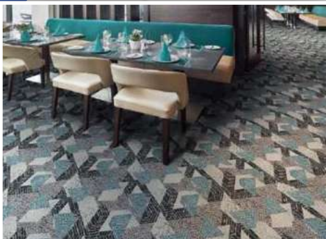
Commercial Wilton Carpeting