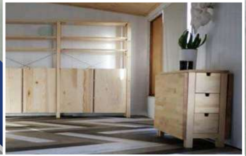
Click Laminate Flooring