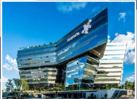
Sasol Head Office Sandton Install Customers own Access Flooring