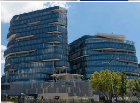
Ernst & Young: Sandton Supply and Fit Access Flooring