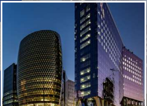
The Marc: 129 Rivonia Road Supply and Install Access Flooring