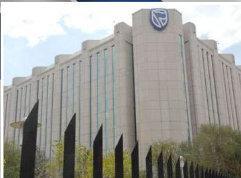
Standard Bank: 3 Simmonds Street Supply & Fit Access Flooring