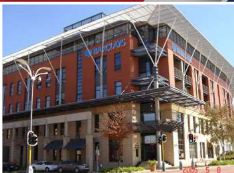
Melrose Arch Supply and Fit Access Flooring