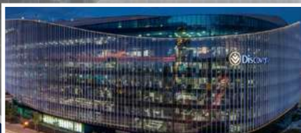
Discovery Health Sandton Supply & Install Access Flooring

With a combined industry experience of over 53 years in the construction industry. The management and contractors of Bates Interior Solutions have more experience the just about any other company in the flooring industry.