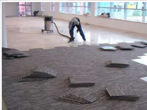
Typical progressive installation in a general office environment