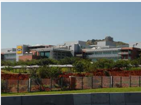
MTN Head office in Fairlands: Supply and Install Raised Access Flooring with a cable Management System