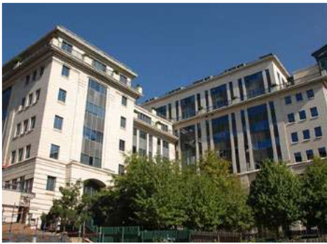
Nedcor Phase 2: Sandton Supply & install Access Flooring