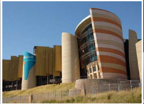
FNB Fairlands: Fairlands Supply & Install Access Flooring