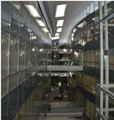
Barclays Absa Capital: Sandton: Supply and Install Access Flooring