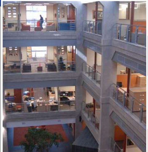
Anglo Gold Ashante: Johannesburg Supply and Install Access Flooring