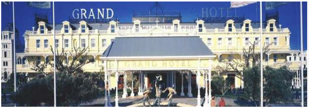
Grand West Casino in Cape Town: Supply and install Raised Access Flooring in the Smoking Casino and Preve'