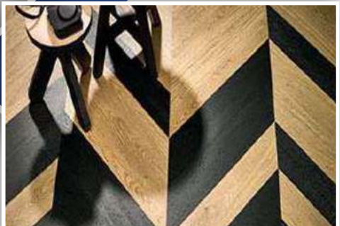
Luxury Vinyl Planks